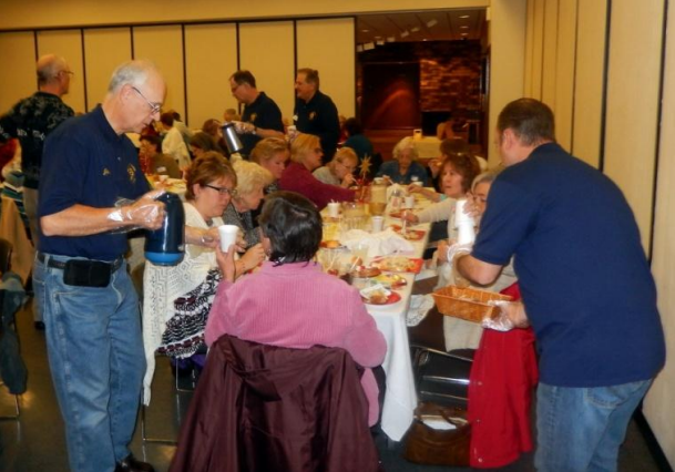
The Knights are serving coffee & tea to the women