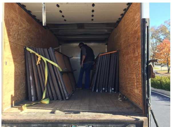
21 Very heavy stage risers loaded into the truck